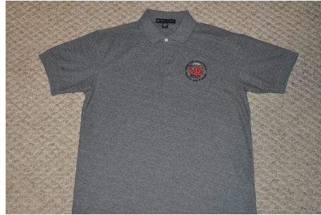
Close up of shirt logo:

Family and Friends shirts are $30.00 each. Sizes are available in Small, Medium, and Large.