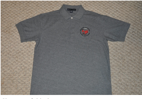
Close up of shirt logo:

Family and Friends shirts are $30.00 each. Sizes are available in Small, Medium, and Large.