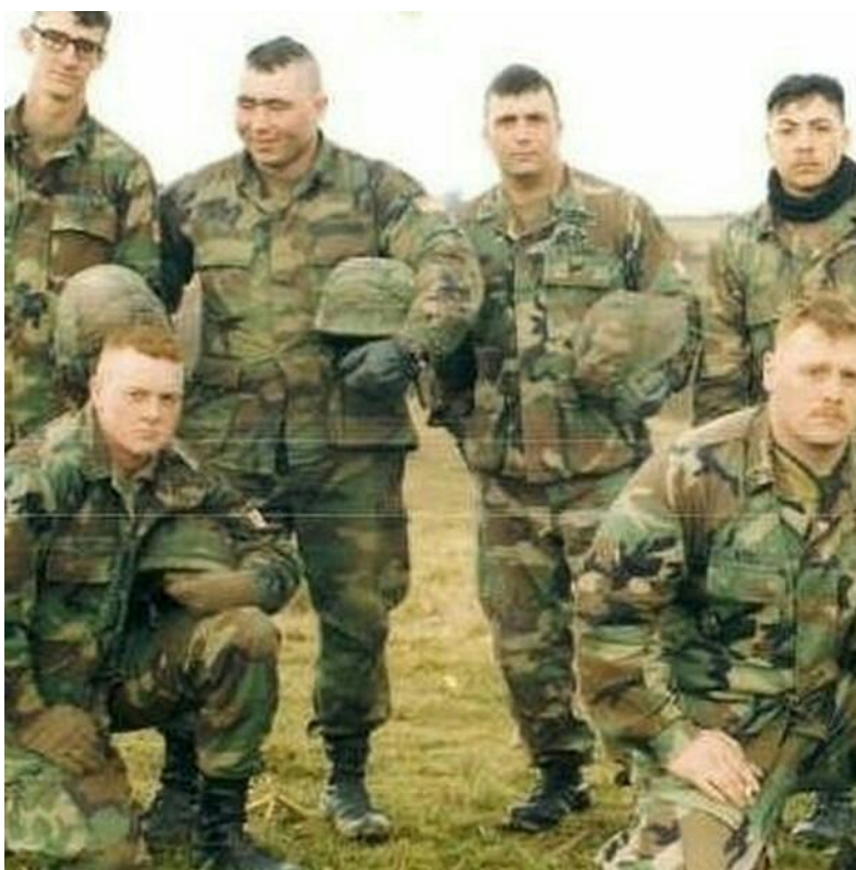
1-508 th in Vincenza, Italy

This is a photo 1-508 soldiers in Vincenza, Italy. Can anyone identify them and know what year the photo was taken?