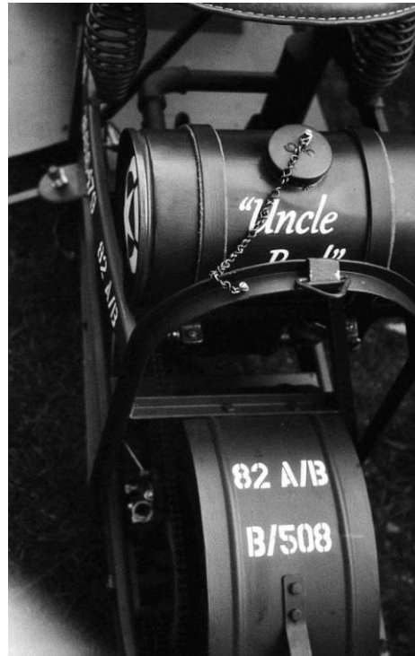
The "Uncle Bud"