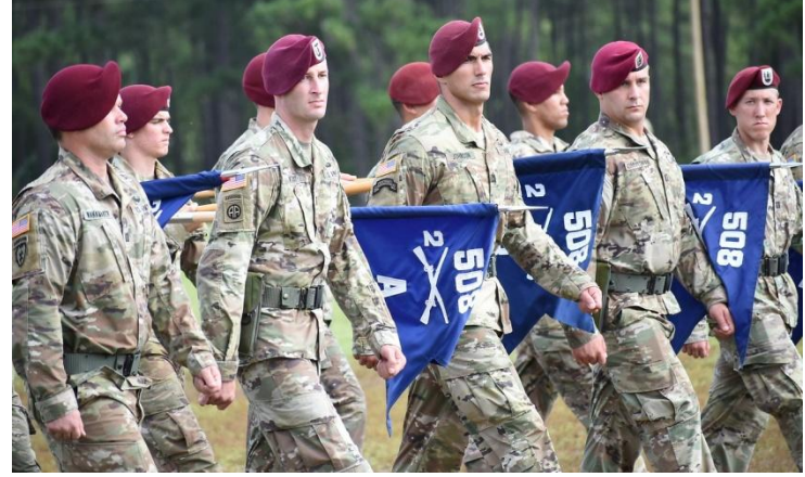
1-508 in Review