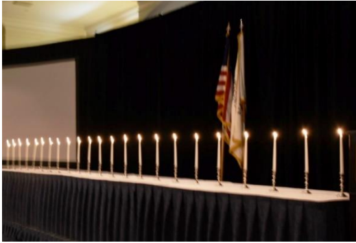
The Memorial Candles