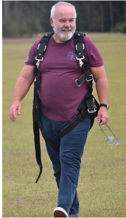
Troy Palmer