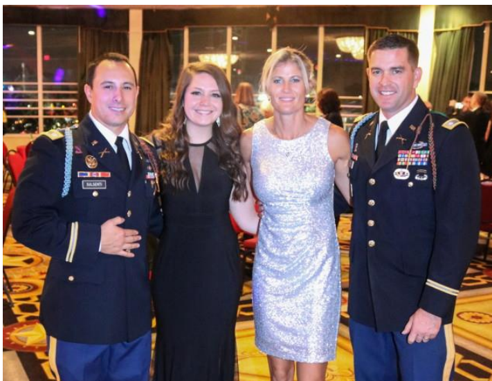
2019 All-Era 508th Reunion