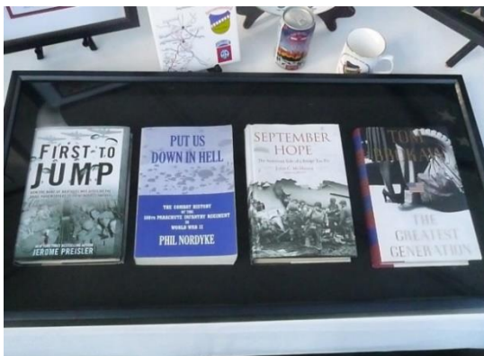
Various 508th & Airborne Articles on Display at the World War II Commemoration