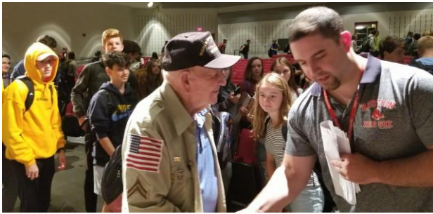
Rock with Frontier Regional High School Students