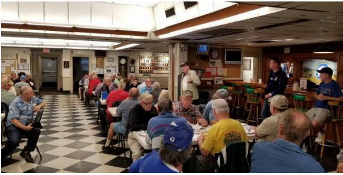
Rock Speaks to Weekly Veterans' Luncheon in Greenfield, MA Sponsored by "Building Bridges"