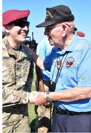
Rock greeting the troops