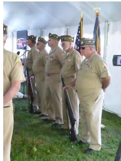
Local VFW Hale-Clapp Post 3295 (South Deerfield) were the Color Guard at the World War II Commemoration