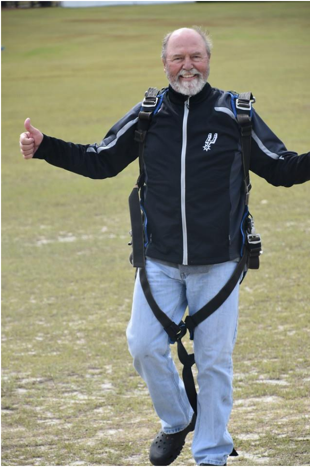
Bill Hamilton