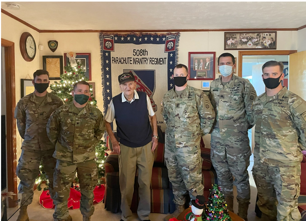
2Fury Visits with Rock on 29 December 2020