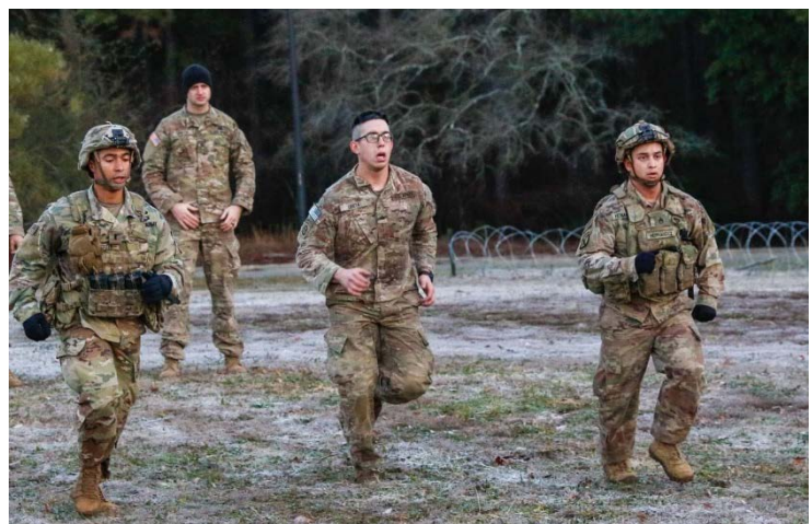
1Fury during Intense Training – Factored into SLOY Award