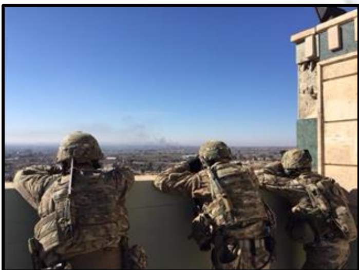
Members of TF 2FURY overlooking the city of Mosul.

TF 2Fury Paratroopers eagerly began learning their roles from their 1-502 counterparts. The Paratroopers immediately understood the importance of owning the responsibilities at TAA Filfayl and were motivated to learn from the outgoing Soldiers. These responsibilities included everything from security of the camp to planning patrols. SSG Shanahan (D Co) and SSG Balona (C Co) have done a spectacular job in ensuring security of our base camp, while 1LT Shannon (D Co) and 1LT Rabbitt (C Co) took the lead on familiarizing our troopers on our new environment to include initial introductions with the Iraqi Army at their planning Headquarters. While members of C Co and D Co were interfacing with their 101 st counterparts, LTC Browning and his staff were doing the same with the 1-502 Battalion