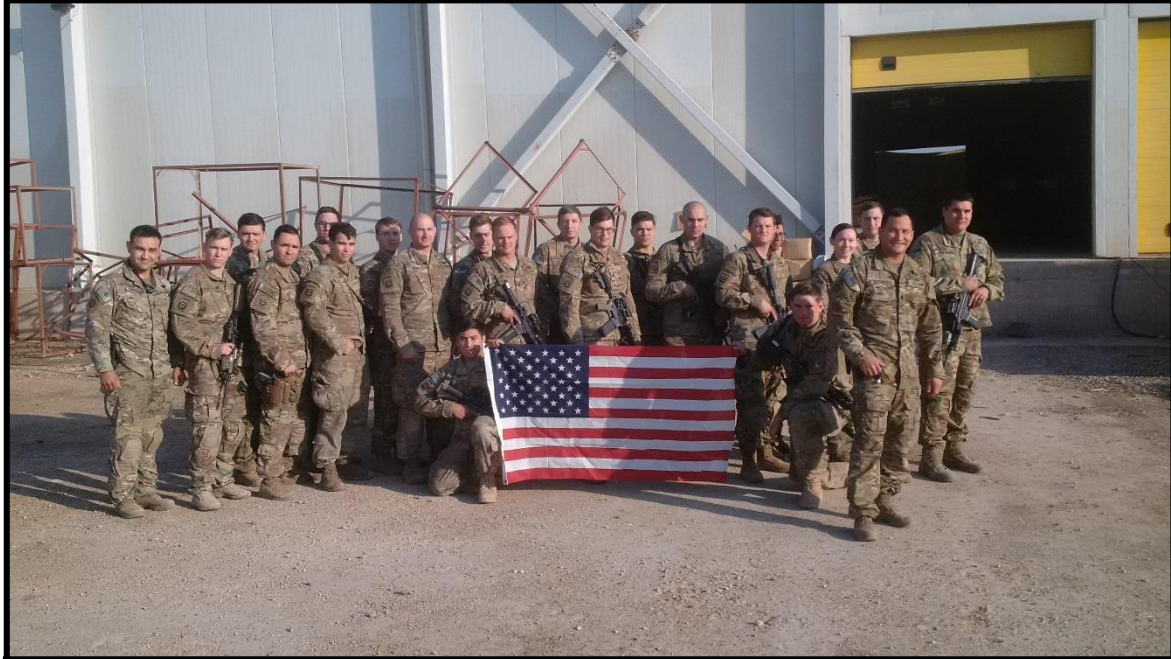
Members of TF 2Fury pose after conducting the tradition of a Patching Ceremony. This moment is historic for all members of the team, especially those on their first deployment. The Patching Ceremony is a way for the Battalion Commander to recognize his Paratroopers for their hard work and service to the unit and Country.