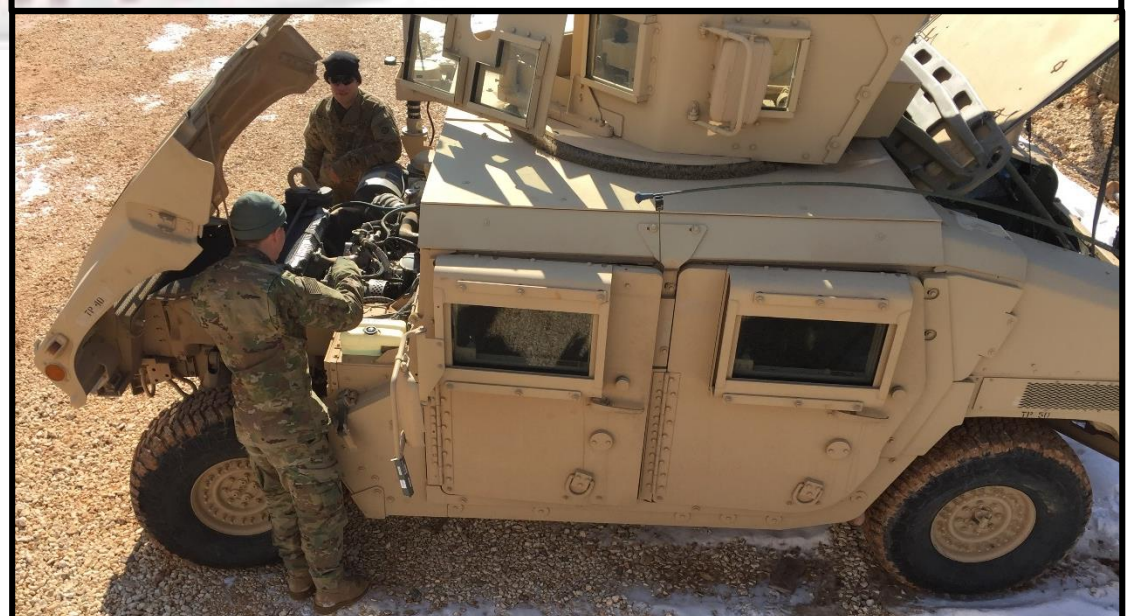
Bottom – Paratroopers conducting Preventative Maintenance Checks and Services on vehicles to use while executing security operations in Turkey.