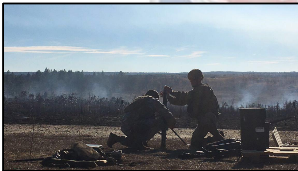
The Mortar Platoon at MORTEP