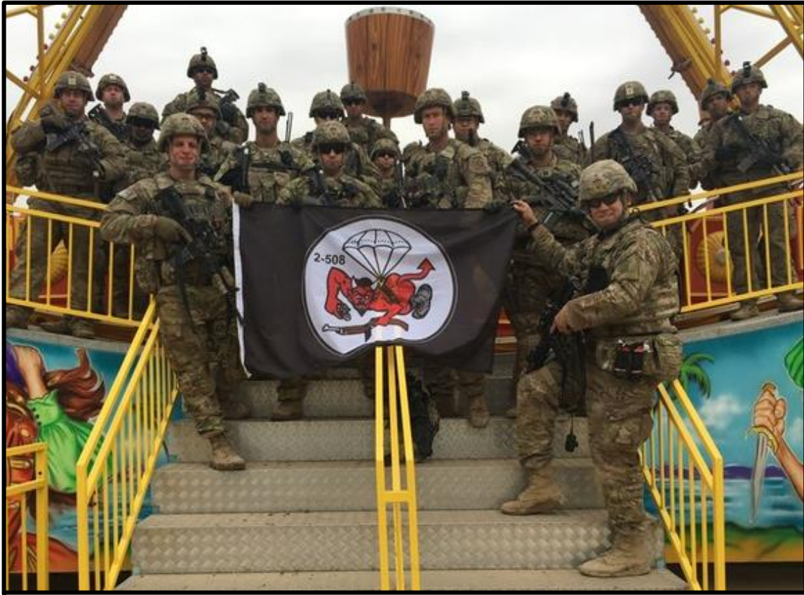
Members of the 2Fury Team pose in front of a recently liberated amusement park near Mosul City.