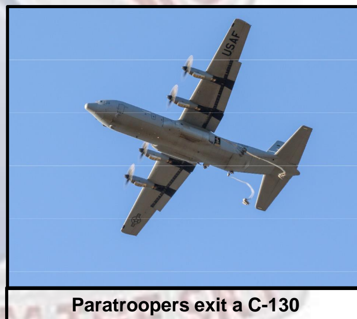
Paratroopers exit a C-130

The Battalion continues to sustain Airborne readiness as these operations are a critical part of keeping our Paratroopers current and qualified to answer the Nation's call on a moment's notice.