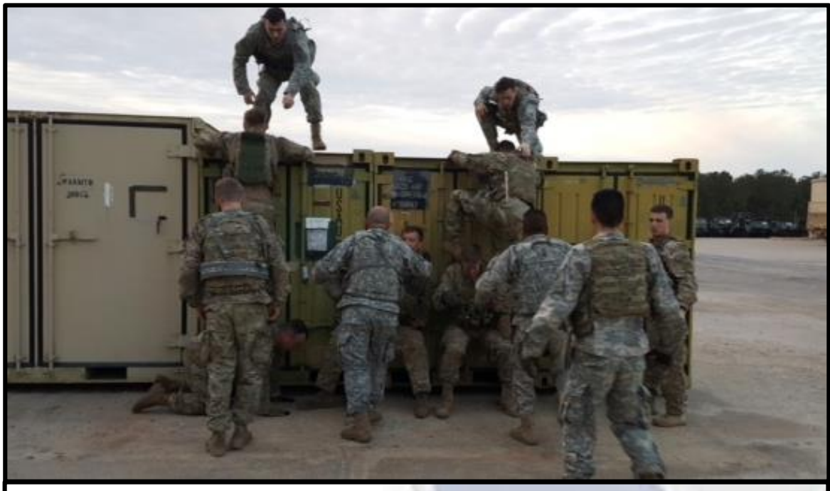
The S-1 and S-3 Sections conducting a PT Competition

This month the 2Fury Paratroopers at Fort Bragg who participated in the Deployment Readiness Exercise as part of the Outload Support Battalion, took their winter block leave during the first half of February. Upon returning from their time off, the Paratroopers hit the ground running in preparation for the upcoming deployment. They have been inspecting attending pre-deployment briefings, busy equipment, zeroing and qualifying with their personal weapons, conducting vehicle training, and getting their medical readiness up to date with the battalion medics. The Family Readiness Group Steering Committee held a meeting on February 21<sup>st</sup> and began planning the upcoming battalion Easter party and future fund raising events.