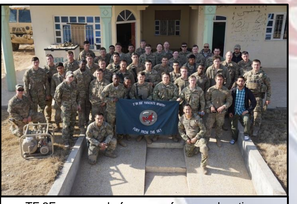
TF 2Fury poses before one of many relocations

At the end of January/early February, Eastern Mosul was deemed liberated by the Iraqi Security Forces. All the units went on a leave period before planning for the Western Mosul clearance operation. For TF 2Fury, this meant a welldeserved rest and refit period at TAA Filfayl before beginning planning for West Mosul. During this rest and refit period, TF 2Fury was realigned with a new Iraqi Army Division. The team said goodbye to the unit they partnered with for East Mosul, and began to forge new relationships with their Western Mosul partners. All in all, the change in mission, locations, and partners for TF 2Fury has created a dynamic, exciting, and fast-paced environment for the unit.