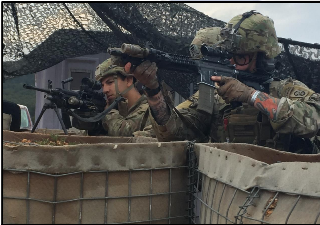
TF 2Fury Paratroopers practice security drills with counterparts

The 2Fury Paratroopers in Turkey are motivated and committed to their security mission with their Turkish partners. Over the last month they have focused on maintaining and improving relations with host nation forces. Those supporting the mission remain in high spirits and never fail to make the best of any situation. Despite the busy schedule supporting the operational mission, they are able fill their time with exercising, sporting competitions, building the relationships with their partners at every step along the way.