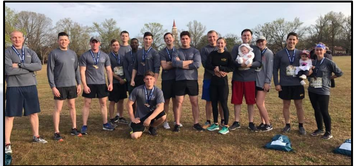
Members of the Brutal Nation family pose after running a 5k