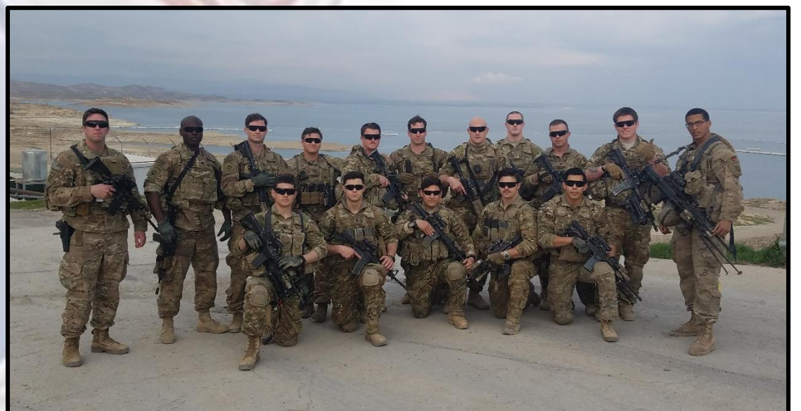
Members of C Co and D Co pose on the Mosul Dam

TF 2Fury also hosted a National Geographic film crew compiling footage for a documentary showcasing how the U.S. is combating extremism around the world. National Geographic is traveling to several military theaters, meeting with commanders at all echelons to produce the multi-series documentary. The team spent several days at both the forward patrol base and the Battalion TAA. Be sure to look for your Paratrooper when the series airs in early 2018 – “Chain of Command”.