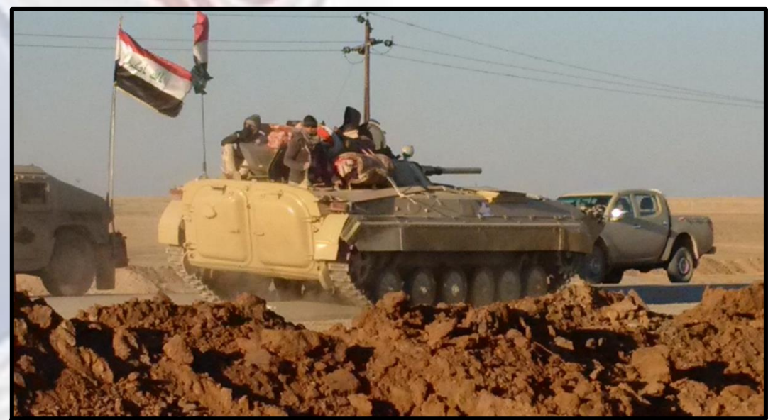
Iraqi BMP repositioning following operations