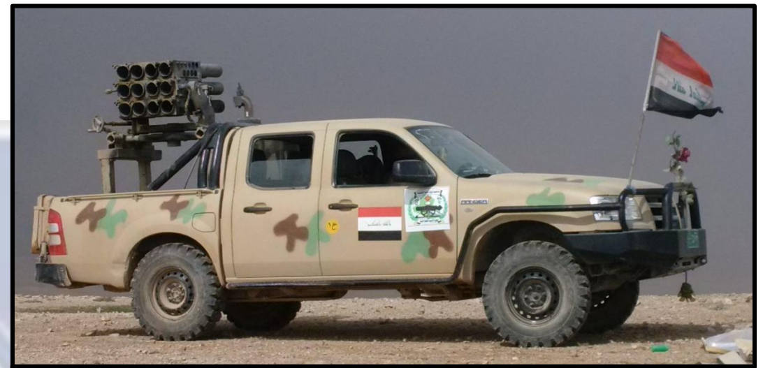
Iraqi truck equipped with rocket system staged at firing point

At the end of February, the West Mosul clearance operation was in its initial stages and TF 2Fury was charged with advising and assisting a new unit – the 9th Iraqi Army Division. Throughout the month of March, TF 2Fury met with their Iraqi counterparts on a daily basis to build trust and become integrated into the Iraqi planning cycle for the operation.