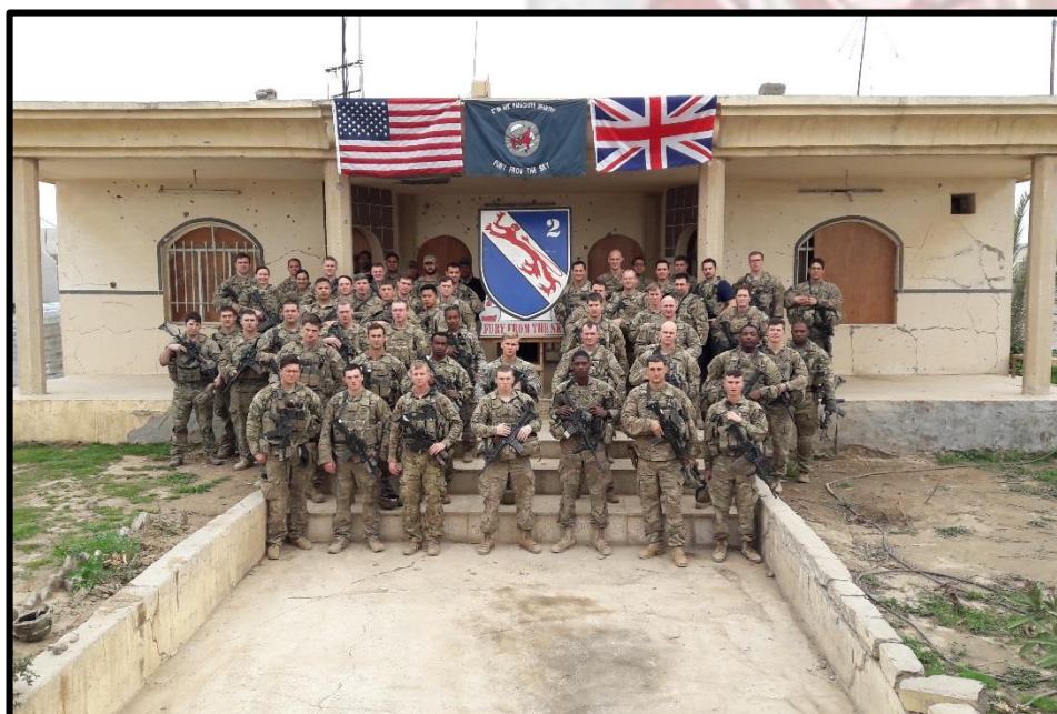
TF 2Fury poses at their new Tactical Assembly Area