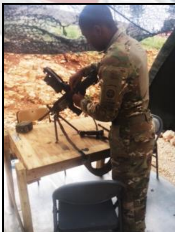
2FURY Paratroopers in Turkey conducting security and weapons maintenance after a critical mission