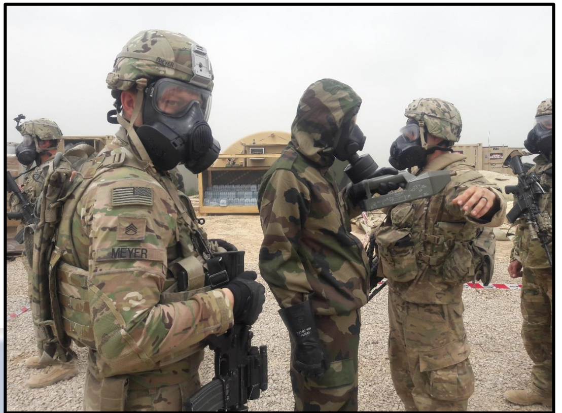
2FURY paratroopers conduct a CBRN exercise with their French counterparts