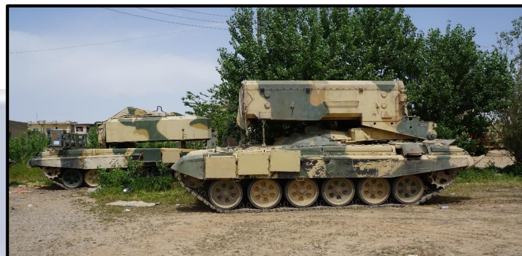
Iraqi Armor Asset staged before major operation