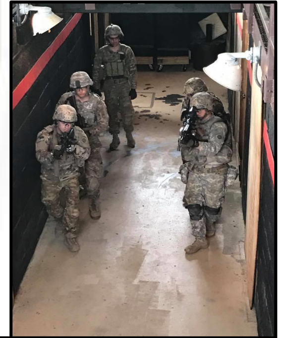
Brutal Company conducting Close Quarters Combat and Advanced Marksmanship Training (top) Paratroopers from the Mortar Platoon drill with their 81mm mortars (bottom)