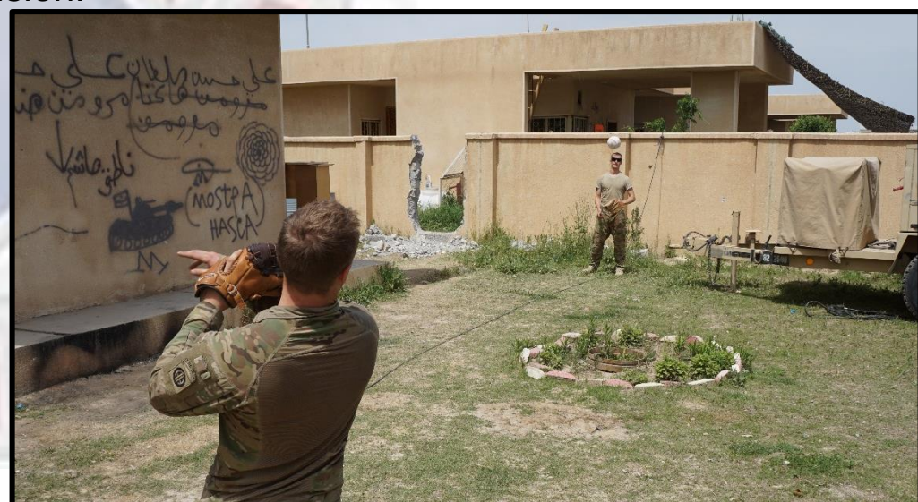
Cold Steel soldiers play catch to decompress