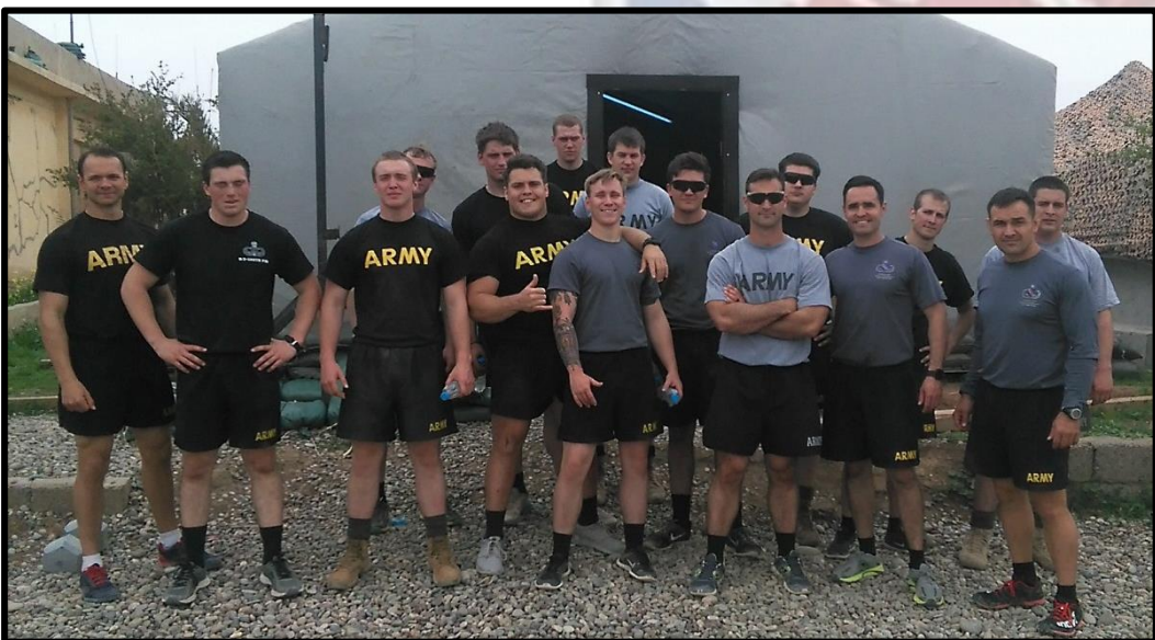
2FURY Paratroopers after completing the TAA fitness test

In April the Paratroopers at Fort Bragg started the month off with the Easter Party at Woodland Park. Fort Bragg schools took spring break during the second week of April and Cumberland County Schools took their break during the third week of the month. Throughout April the Rear Detachment has participated in several training events. The Havoc Company conducted chemical training by putting Paratroopers through the infamous "gas chamber" and the Mortar Platoon conducted a "hip shoot" where they practiced hastily emplacing their indirect fire weapons systems into action. Alpha Company is preparing for their upcoming live fire exercise in squads of 8-10 soldiers and they continue to maintain readiness in case they are called to support the Global Response Force. Brutal Company conducted a live fire training event with teams of 4-5 soldiers and weapons training in a shoot house or urban environment. Cold Steel Company qualified with their light machine guns and trained the whole company on advanced medical care. Juliet Company conducted driver's training utilizing a virtual computer like training system. The Family Readiness Group Steering Committee held a meeting on April 11th and continued planning future fund raising events, specifically the All American Week Sunset 5k Run (22 May) and the Airborne Review (25 May).