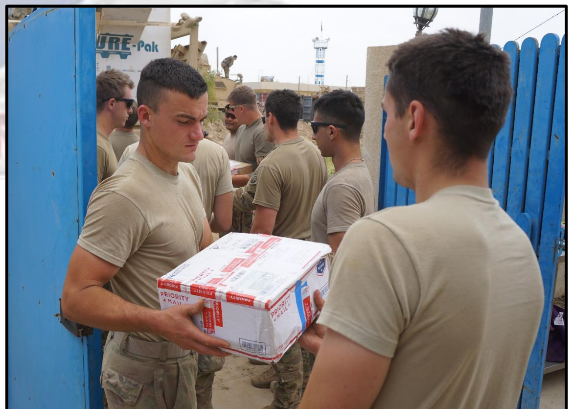
TF 2FURY Paratroopers distribute letters and packages when a mail convoy arrives at their location