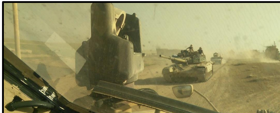
2FURY Convoy observes an Iraqi Armor element through the haze outside West Mosul