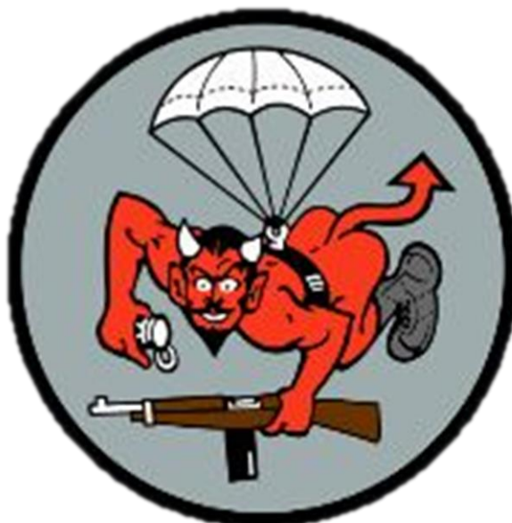
Also Available as a 3" Patch