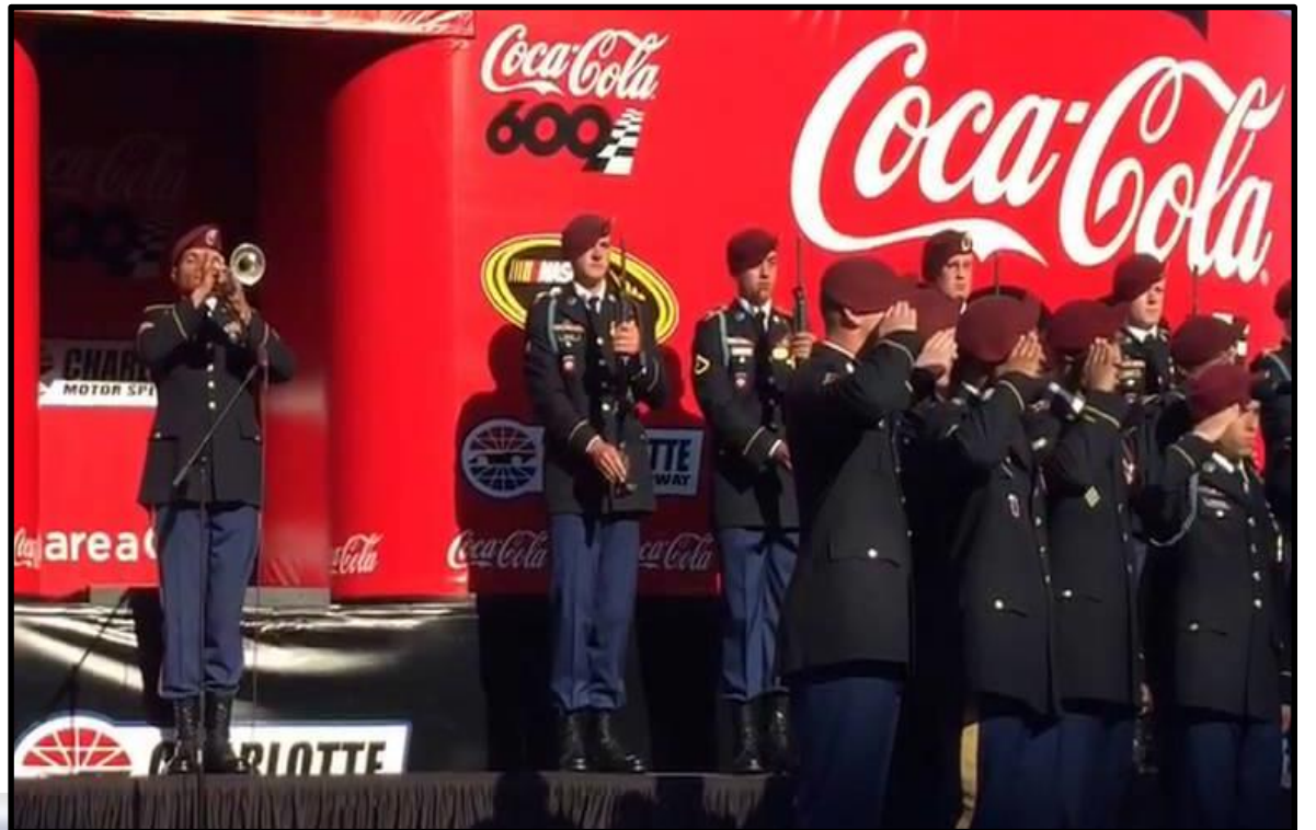
Brutal Company Firing detail representing the 82 nd ABN DIV at the NASCAR Coca Cola 600 in Charlotte, NC