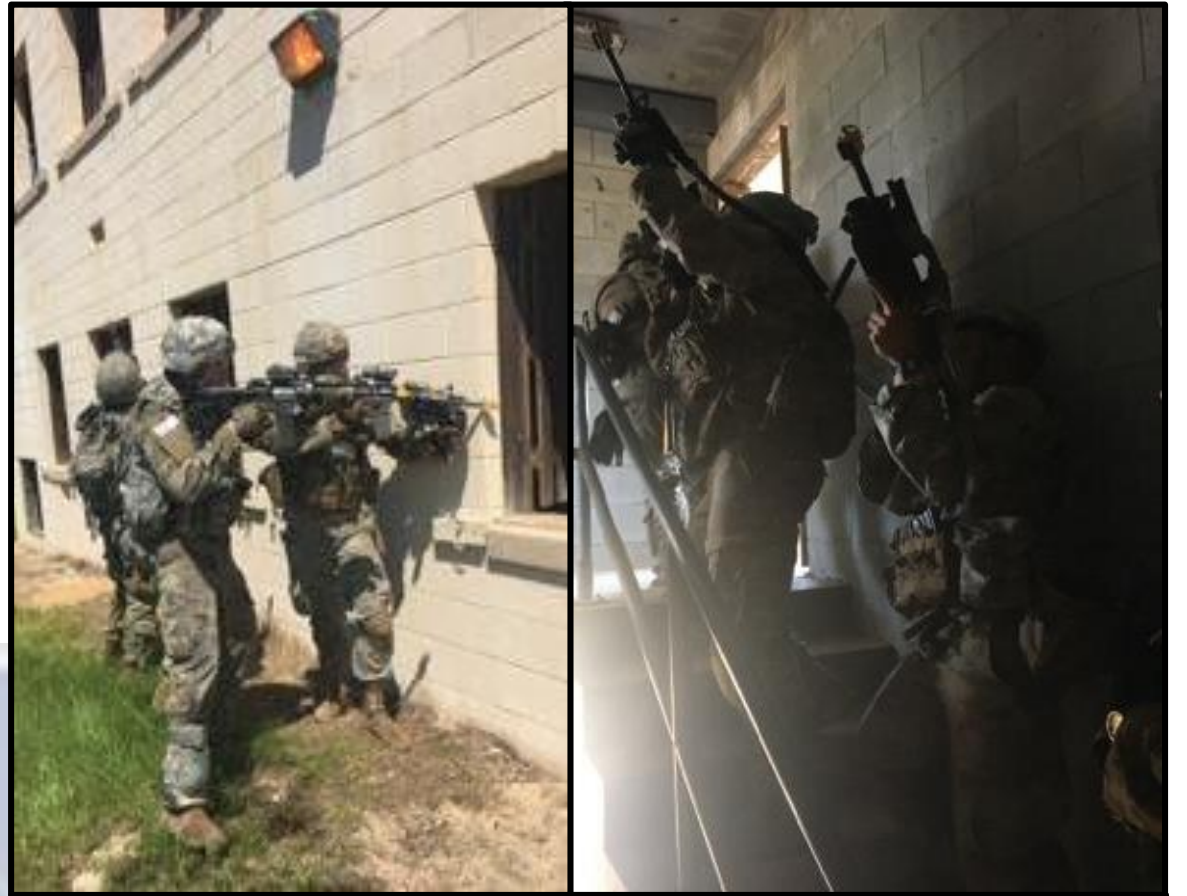
A CO conducts Squad Situational Exercise at Holland Military Security Compound