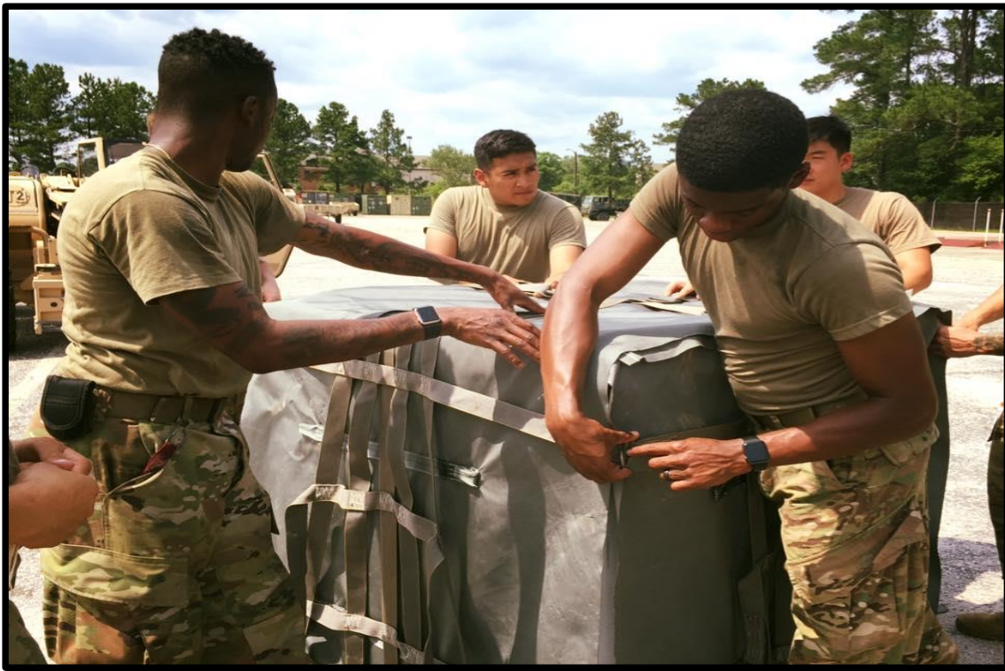
Juliet Company Paratroopers conduct sling load training