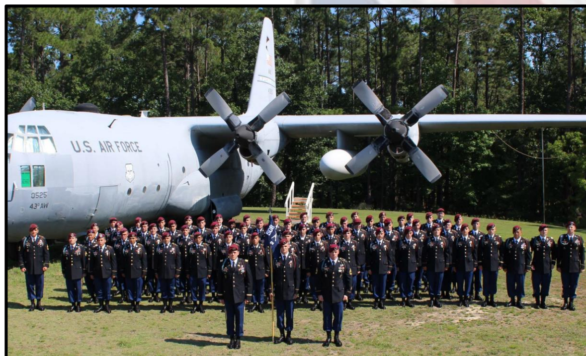
Brutal Company standing proud at the 82 nd Airborne Division Museum for great photo after a grueling week of squad live fire exercise

Happy June 2FURY Friends and Family! As Independence Day approaches, please take a minute to recognize the significance of freedom and the historical effort that the Iraqi Security Forces endure to liberate their country. Our Iraqi counterparts are nearing a momentous day where they will close out major military operations in Mosul -- liberating a city the size of Philadelphia from the clutch of ISIS. June definitely started to heat up, but the tough 2FURY Paratroopers continued to embrace the austere conditions, sweltering heat, and changing circumstances. The entire team is continually amazed by the tough 2FURY Paratroopers.