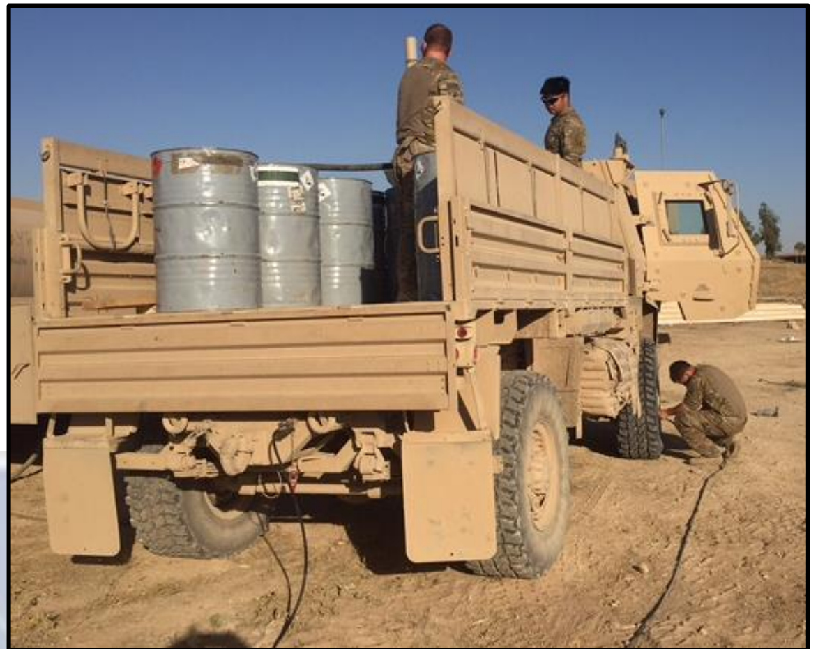
SGT Hawker fills the LMTV tire while SPC Friez and SPC Ronquillo resupply the patrol base with fuel

Key calendar events celebrated and acknowledged this past month were the Army's birthday (14 JUNE), LTC Browning's birthday (15 JUNE), Father's Day (18 JUNE), and Ramadan (27MAY-25JUNE). Father's Day was an important day to highlight for TF 2FURY due to the overwhelming number of fathers within its ranks. Most have now spent multiple Father's Days abroad during the Global War on Terror with a select few having spent more time deployed than the newest Paratroopers have spent in the Army itself. This is a small realization to the service and dedication of those within TF 2FURY team and the Army as a whole. Ramadan is a significant calendar event that our partners observed. For Muslims worldwide, Ramadan is a month of fasting (Siam) to commemorate the first revelation of the Quran to Muhammad according to Islamic belief. This annual observance is regarded as one of the Five Pillars of Islam. While fasting from dawn until sunset, Muslims refrain from consuming food and drinking liquids. To show their respect, TF 2FURY members are asked not to overtly eat or drink in front of our counterparts.