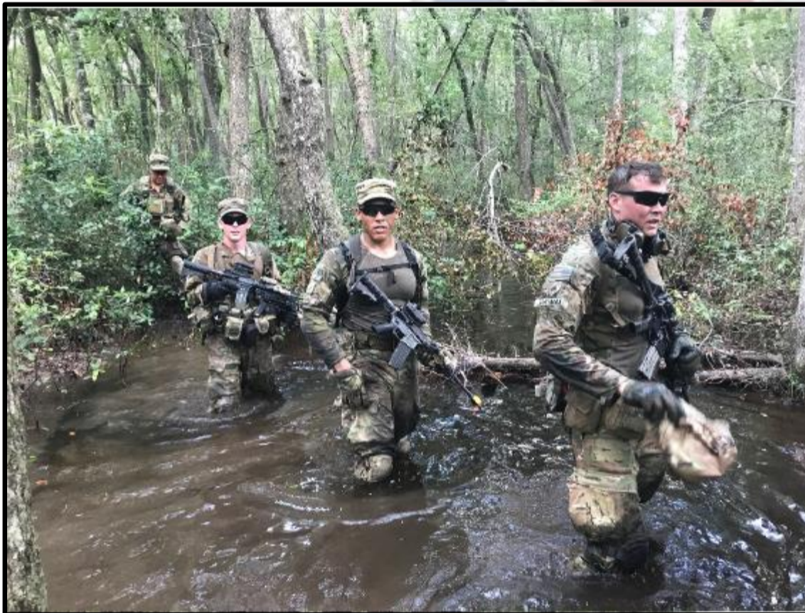
Brutal Paratroopers conducting PLT STX Training

In August the Rear Detachment got back to training after returning from block leave on August 6 th . HHC went to the field with the Mortar Platoon conducting a Squad Situational Training Exercise. The S3 shop set up the Tactical Operations Center and practiced battle tracking while the S6 Team set up their communications systems and a retransmission station. The Medics set up their Aid Station and practiced treating casualties. Meanwhile Alpha Company is preparing for an Opposition Forces rotation at the Joint Readiness Training Center at Fort Polk, Louisiana. Bravo Company conducted a Platoon Situational Training Exercise. Charlie Company conducted Combat Life Saver Training and Juliet Company conducted Warrior Skills and Battle Drill classes. The FRG has been eagerly preparing to welcome the forward element home with the first redeployers arriving at Fort Bragg in late August.