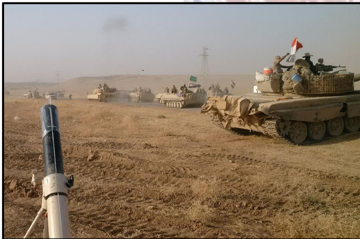
9 th IA tanks push out from their assembly areas

As we move closer to the end, several of our Paratroopers transitioned to execute outload operations throughout several bases in Iraq and Kuwait to move our equipment back to Ft. Bragg, NC. Their responsibilities included receiving and preparing equipment to get shipped overseas as well as receiving Paratroopers as they make their journey home.