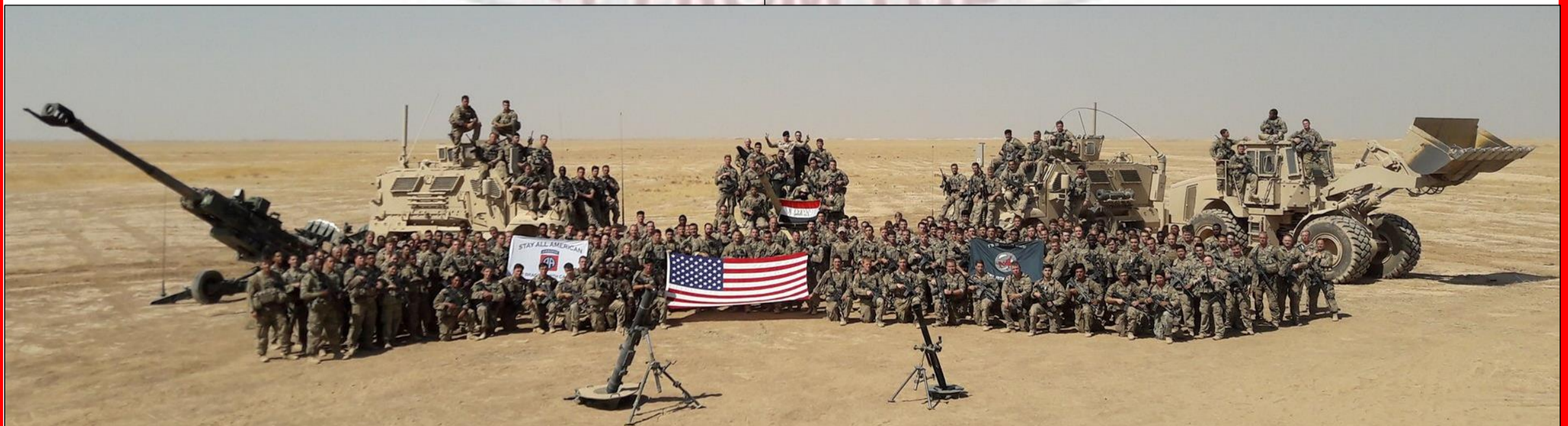
Members of TF 2FURY take one last Battalion photo before they begin their transition back to Fort Bragg

The Paratroopers of TF 2FURY are looking forward to returning home to their families. We have some who only have days left while others just a few weeks. Once members get back they will go through the reintegration process. This includes everything from updating medical and financial readiness records to airborne jump progression. This will allow them to ease back into life with their families and the high pace of Fort Bragg. The resiliency that the Paratroopers have shown here will be the same they show once they return to the United States. Once reintegration is complete, our Paratroopers will take some well deserved leave.