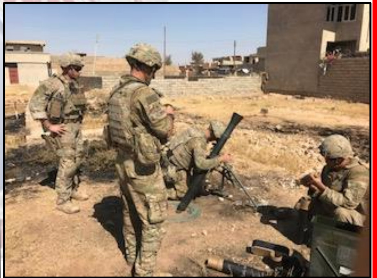
The Charlie Company Mortars prepare for operations in Avghani, just north of Tal Afar

The eighth month is now complete and across the Brigade, several Falcon Paratroopers have already made the journey home. It makes it all the more real how close we are to being mission complete. But until the day we leave country and depart Kuwait our job is not done. This month brought the transition of the 2FURY Team once again as our Iraqi counterparts initiated their attack to retake the city of Tal Afar. Located just over 35 miles west of Mosul, Tal Afar is a considerably smaller city with an estimated population of 200,000 versus Mosul's 1.8 million. In 2014, ISIS invaded Tal Afar and planted their black flag in the city center. After 3 years of ISIS oppression, our Iraqi army counterparts liberated the city in just eight days.