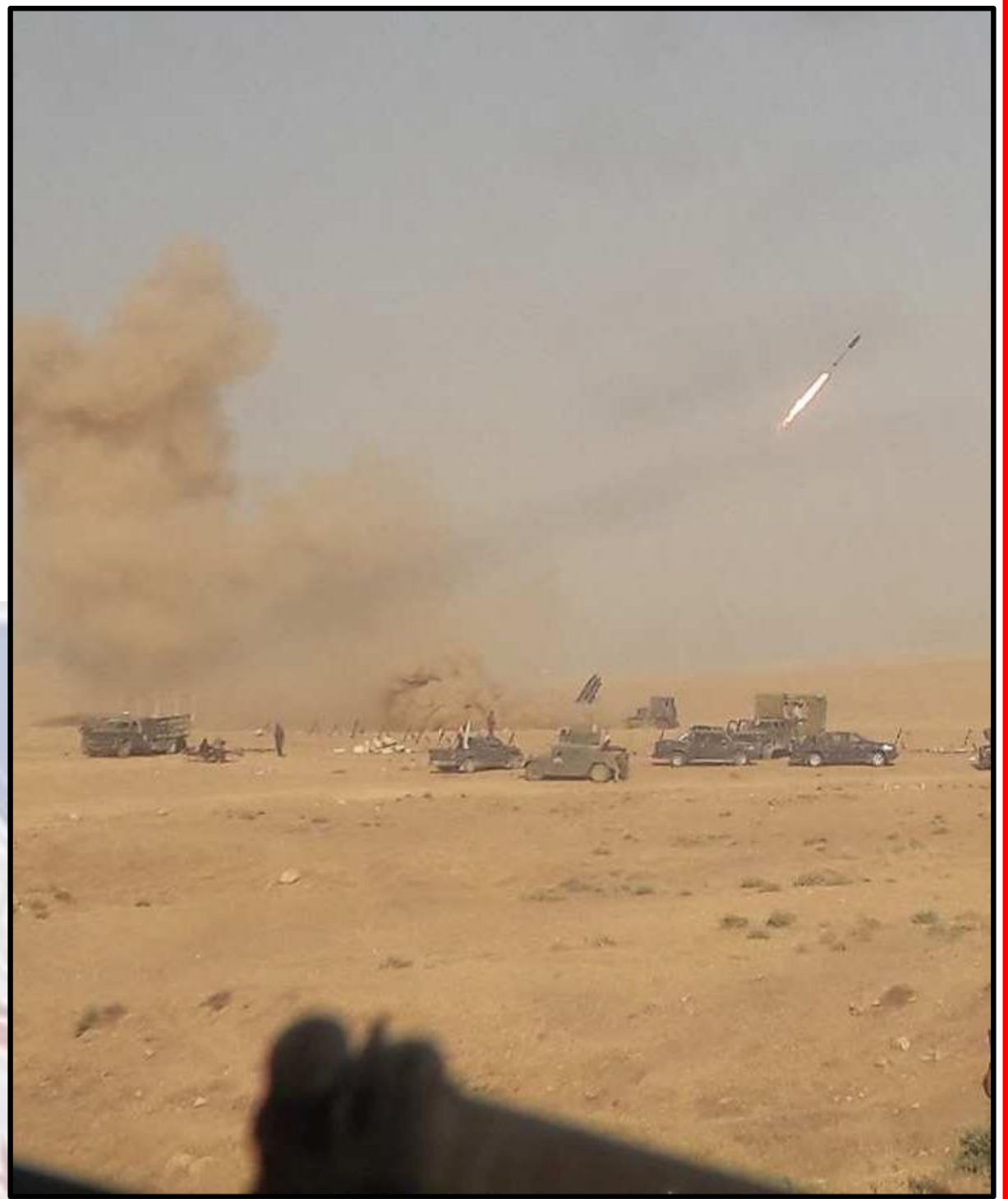
ISF rockets launch pre-assault fires on Tal Afar

Following the liberation of Tal Afar, members of the Task Force quickly transitioned the fight to Avghani, a smaller city to the north where ISIS fighters sought refuge after being driven from Tal Afar. Due largely in part to the hard work and dedication of our leaders and Paratroopers, ISIS once again saw defeat at the hands of the 9 th IA. With the next fight already under way and the ISF beginning their transition to defeat ISIS south of Ninewa Province, many members of TF 2FURY begin their transition with the closing of TAA Tal Majan. With that closure comes the next phase of the campaign against ISIS. This time however, 2FURY will not be at the tip of the spear for this fight. Members of the battalion have already begun to hand over responsibility to the incoming unit who will be more prepared and better postured to take on the fight.