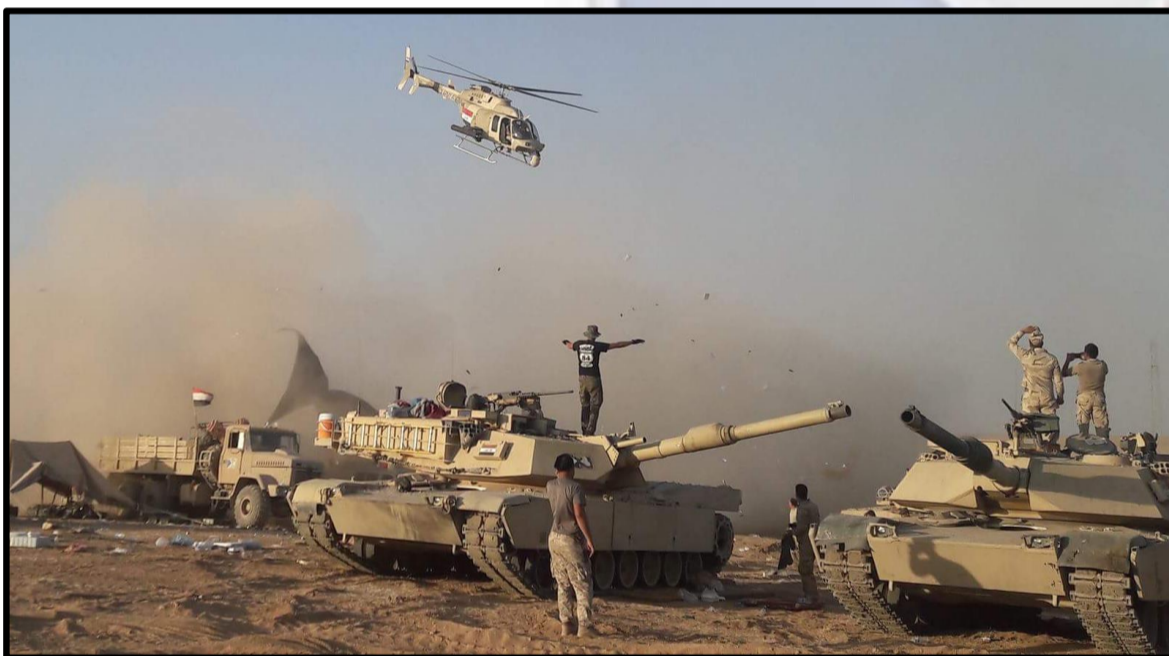
The 9 th Iraqi Army postures its tanks and rotary wing assets for the attack into Tal Afar

Once TF 2FURY made its transition west, our Paratroopers immediately went to work on the next fight. Whether conducting base defense, executing strikes on the enemy, or advising and assisting our Iraqi counterparts, every single Paratrooper played a vital role in our mission's success. In just over a week, the city of Tal Afar was liberated from ISIS forces. This was largely in part to the Falcon Brigade working around the clock to ensure that our Iraqi counterparts always had our support when they needed it. The TF 2FURY Tactical Assault Center all went forward to establish a joint Strike Cell in order to support the 9 th IA's maneuver into Tal Afar. The Strike Cell forward communicated with the Tactical Operations Center, located back at Tactical Assembly Area Tal Majan, in order to coordinate and deliver close air support, close combat attack, and artillery strikes.