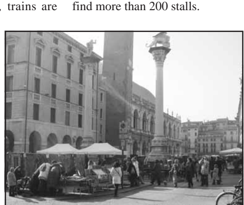
The Vicenza antique market is this weekend.

Online train tables and ticket prices are available on Trenitalia's Web site: www.trenitalia.it, which is available in English.