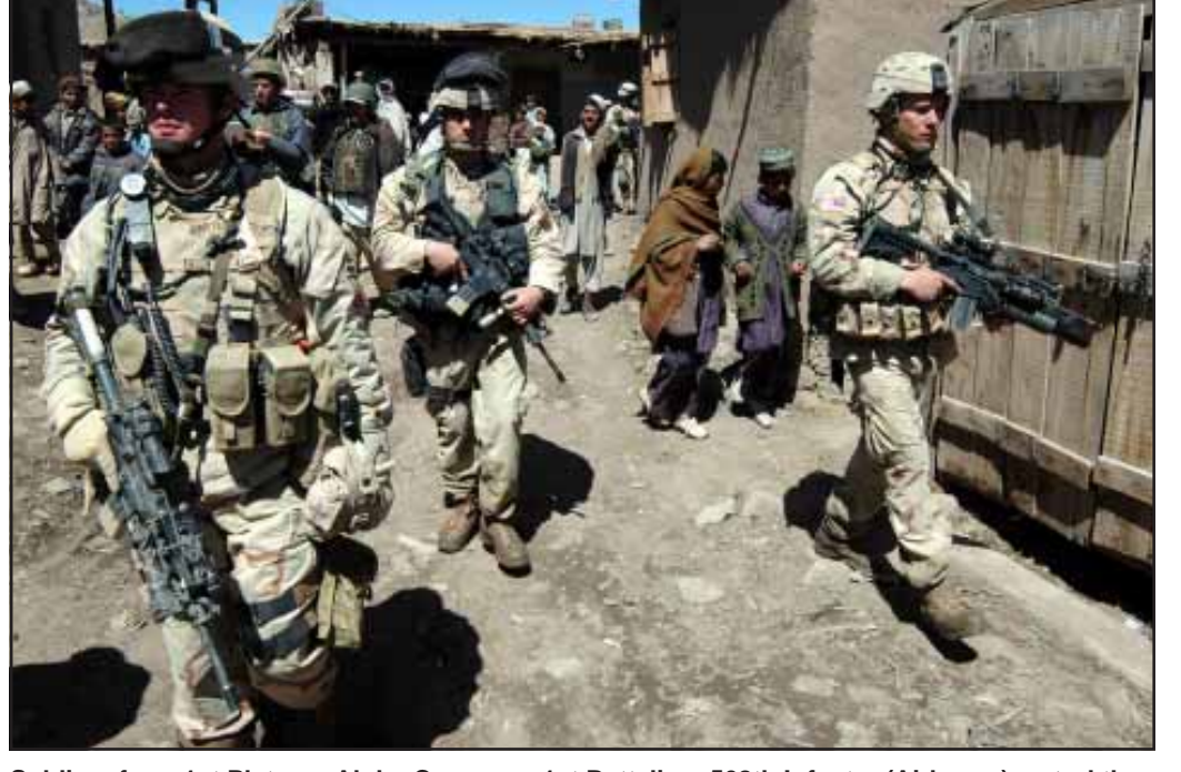
Soldiers from 1st Platoon, Alpha Company, 1st Battalion, 508th Infantry (Airborne), patrol the small town of Naka during a mission there March 24.

April 11-25 - Traffic flow will be restricted on 6th Street and by the AAFES garage. No parking will be allowed on the sides of the street. There will be no overnight parking allowed in the AAFES garage parking lot.