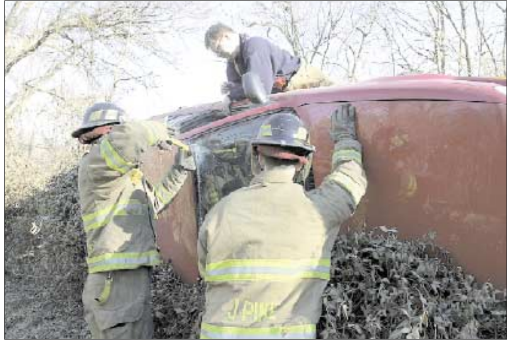
JOSH DOOLEY • THE MORNING NEWS

Rogers firefighters work to free a woman who was trapped but not visibly injured Thursday when the small sedan she was traveling in skidded across East Walnut Street and flipped onto its side, landing against a bush-covered fence near Lake Atalanta.